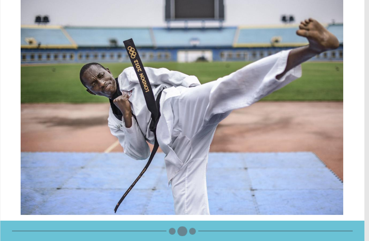
2021 Asian Open Championships